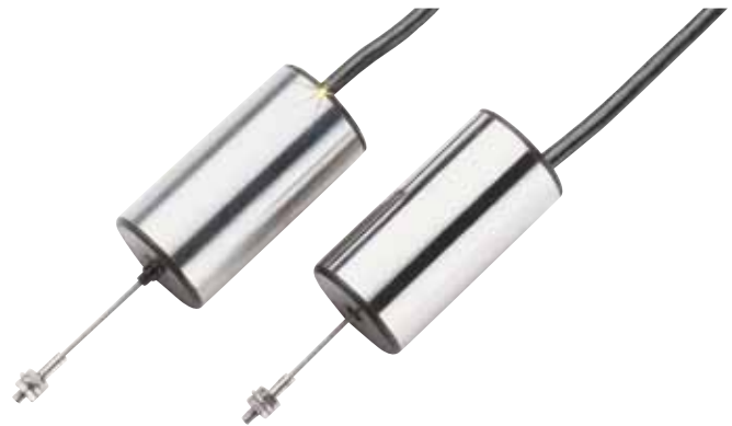
LD400 Miniature DC Output LVDT Transducers.

Force-Extended Armatures: Use internal spring mechanisms, pneumatic force, or electric motors to push the armature continuously to its fullest extension possible. Force-extended armatures are used in LVDT's for slow moving applications. These mechanisms require no connection between the specimen and armature.