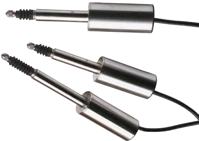
LD500 LVDT Precision DC Gaging Transducers.

A linear variable displacement transducer, or LVDT, is an electrical transducer used in measuring linear position. Linear displacement is the movement of an object in one direction along a single axis. Measuring displacement indicates the direction of motion. The output signal of the linear displacement sensor is the measurement of the distance an object has traveled in units of millimeters (mm), or inches (in.), and can have a negative or positive value.