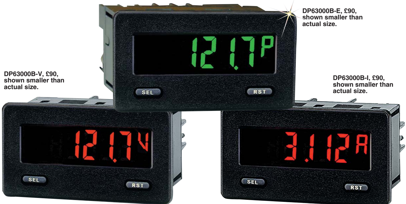
DP63000B-V, £90, shown smaller than actual size.