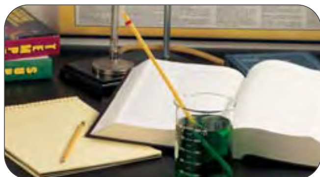
Available with red safety liquid, in a variety of ranges and styles.

Economical glass-bulb thermometers are ideal for school and laboratory applications. These general-purpose, easy-to-read white back units are available with red liquid filling, in a variety of ranges and styles.