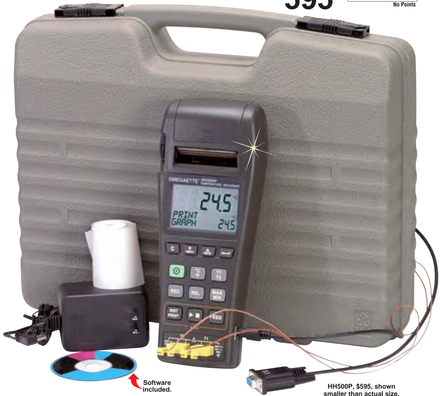
HH500P, $595, shown smaller than actual size.