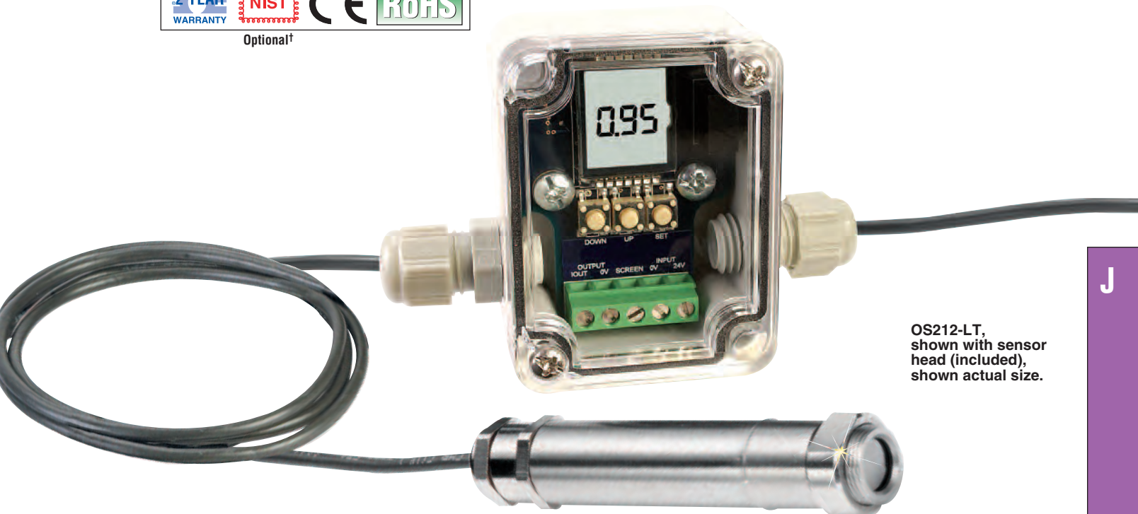
OS212-LT, shown with sensor head (included), shown actual size.