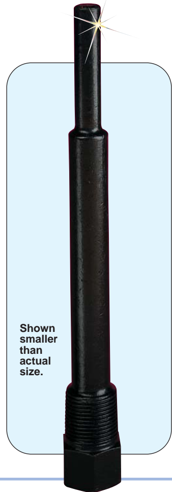
Shown smaller than actual size.

Ordering Example: E11202101/1/2-260S-U10 1/2-304SS, PFA coated 304 SS, 260S Series thermowell with a U dimension of 10 1/4", £27 + 32 = £59.