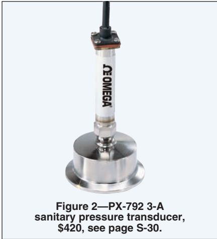
Figure 2—PX-792 3-A sanitary pressure transducer, $420, see page S-30.

Figure 2 shows a 3-A sanitary pressure transducer. This device is typically used in dairy, food processing, pharmaceutical, and biotech applications. Construction is all stainless steel with an electro-polished finish. This unit is designed for clean-in-place operation. This sensor utilizes thin-film technology which is known for reliability and accuracy. It is calibrated to NIST standards. The low response time of 5 msec ensures tight process control. The reading is delivered via a 1 to 5 Vdc output signal or a 4 to 20 mA current loop.