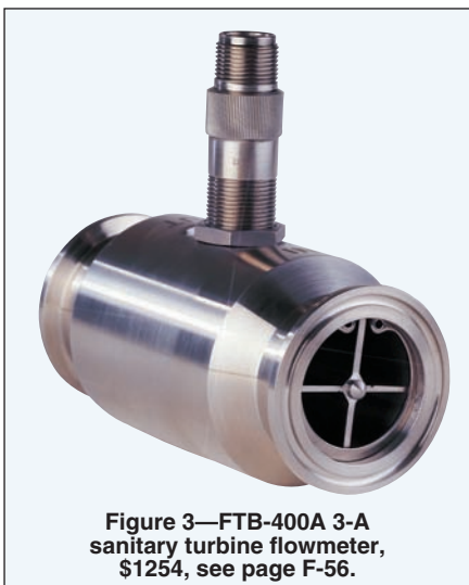
Figure 3—FTB-400A 3-A sanitary turbine flowmeter, $1254, see page F-56.

Sanitary turbine flowmeters, such as the unit shown in Figure 3, are used in processing liquids and beverages. They are also found in applications requiring pasteurization and can be used for thicker materials such as ketchup and chocolate. Units are available in sizes ranging from ¼ to 3" in diameter. This type of sensor covers flow ranges from a fraction of