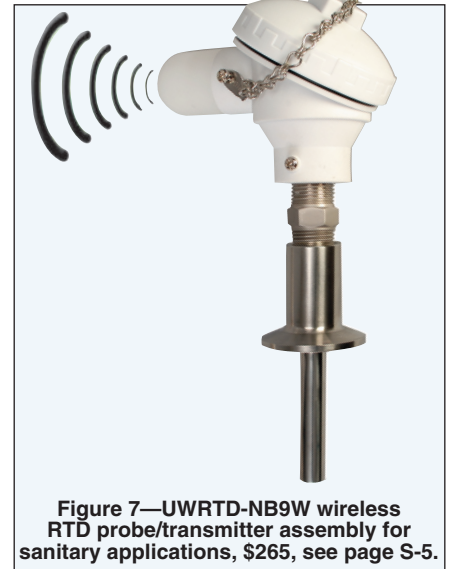
Figure 7—UWRD-NB9W wireless RTD probe/transmitter assembly for sanitary applications, $265, see page S-5.

well as add analytical and control software to improve process control and monitoring. Figure 7 shows an RTD-to-wireless unit that transmits measurements to a matching receiver that can handle up to 48 channels. Matching software logs data and provides process control signals.