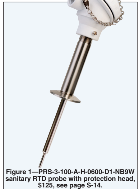
Figure 1—PRS-3-100-A-H-0600-D1-NB9W sanitary RTD probe with protection head, $125, see page S-14.

The most accurate and most popular device for process temperature control is the RTD (resistance temperature detector) Figure 1. An RTD that meets 3-A sanitary standards can be provided in the form of a probe for direct immersion (and faster response time) or can be enclosed in a thermowell for mechanical protection and ease of replacement. Direct immersion RTD sensors are provided with straight or stepped probe designs depending on response time and process flow conditions. The wetted surfaces are 316L stainless steel, and are highly polished to meet 3-A requirements. These sensors are also supplied with traditional connection heads, M12 connections, integral extension cables or wireless features for ease of installation.