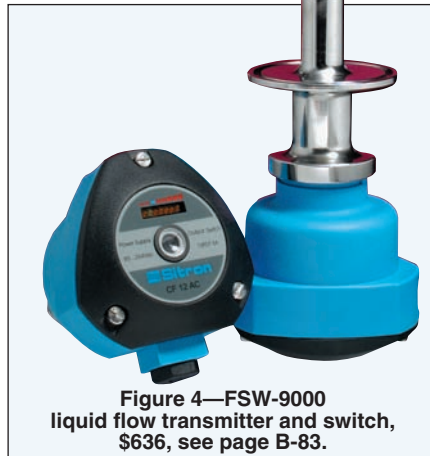
Figure 4—FSW-9000 liquid flow transmitter and switch, $636, see page B-83.

The Model FSW-9000 transmitter/switch shown in Figure 4 monitors the flow velocity of the product based on the principle of thermal dispersion between heated and unheated RTDs immersed in the product. It generates an analog output signal corresponding to the flow rate and includes a set point feature which can signal a process controller or operator when a specified flow is achieved. If an actual flow measurement is not required, a simpler flow switch can be used to signal when the flow rate set point is reached.