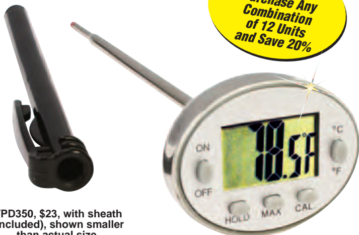
TPD350, $23, with sheath (included), shown smaller than actual size.

Cheaper by the Dozen! Purchase Any Combination of 12 Units and Save 20%