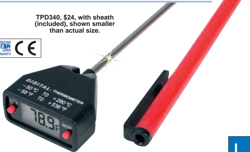
TPD340, $24, with sheath (included), shown smaller than actual size.

Measurement Range: -50 to 280°C (-58 to 536°F) Accuracy: ±1°C for -20 to 120°C; ±2°C for -20 to -50°C and 120 to 150°C; ±4°C for 150 to 200°C; ±6°C for 200 to 280°C Resolution: 0.1° for -19.9 to 199.9, otherwise 1° Sampling Rate: 0.5 second Probe Length: 203 mm (8") Power Source: One LR44 battery (included) Ambient Temperature: -10 to 50°C (14 to 122°F) Button Functions: On/off and °C/°F