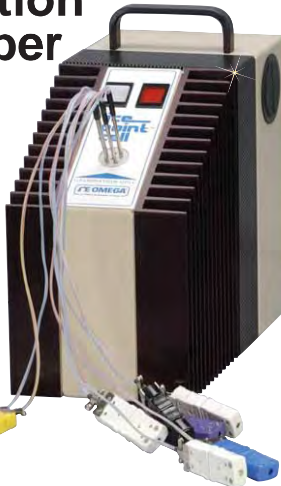
TRCIII, $1175, shown smaller than actual size.

Use up to 6 probes at one time with TRCIII