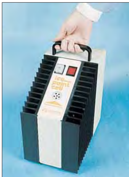
Sturdy handle for easy portability.